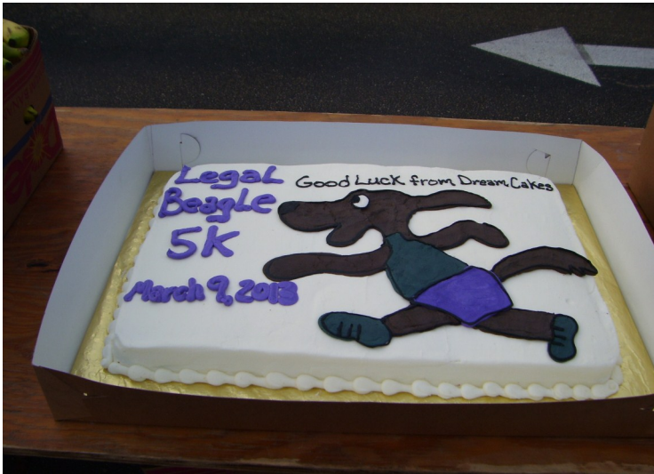
JYL Hosts its Sixth Annual Legal Beagle 5K Walk/Run Legal Beagle Race Cake