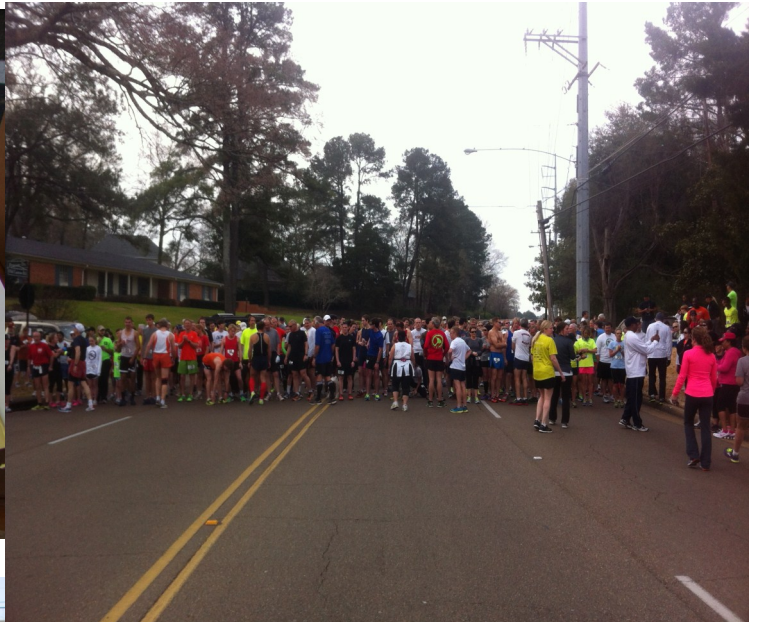
At the starting line waiting for the horn.