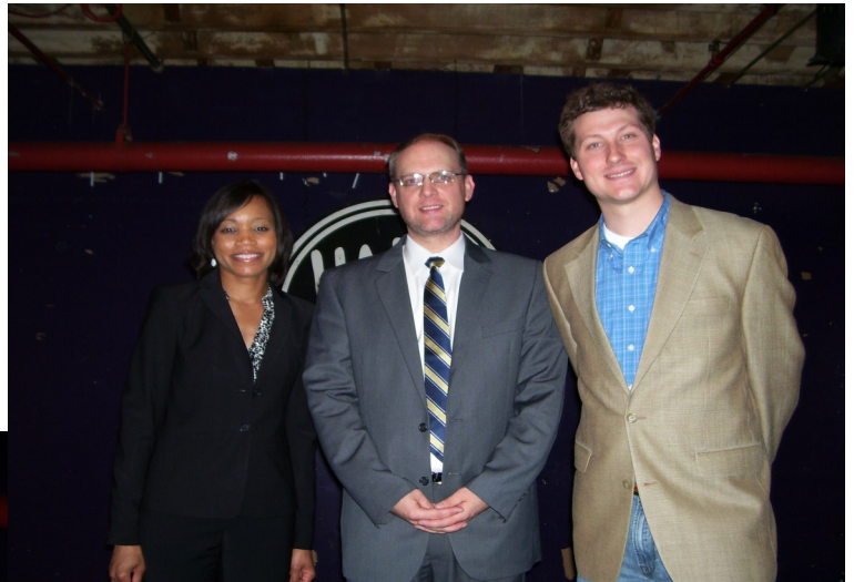
Huge crowd enjoys JYL’s Final 2012-13 Membership Luncheon and CLE at Hal and Mals